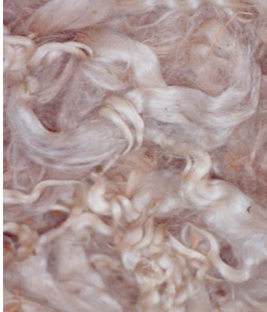
LARGE WAVE / BROAD LOCK